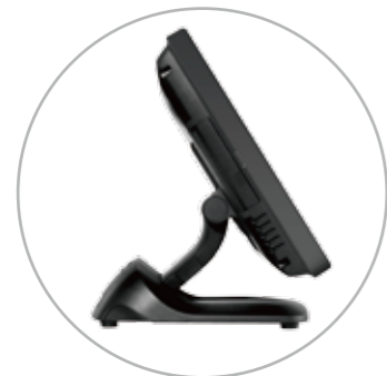
Full Extended Mode

The XT-8315 provide the selection of two foldable bases, the curvy slim GEN7E base and the larger but practical GEN8E base. The foldable base can be configured into "Flat Folded Mode" to save the shipping package volume, "Low Profile Mode" to allow greater interaction between the cashier and the customer, and the traditional "Full Extended Mode". All this can be achieved with a simple pull of the hidden lever.