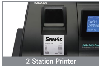
2 Station Printer