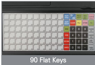
90 Flat Keys