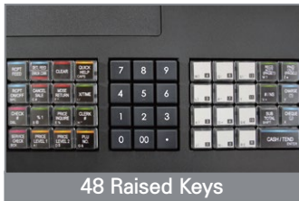
48 Raised Keys