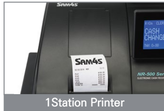
1 Station Printer